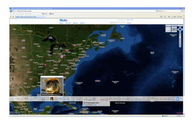
Figure 1. Example of Flickr web site that allows users to "geotag" and publish their photographs

Ambiguities in the meaning of the word "standard" complicate these considerations. When we achieve goals of interoperability through broadly shared practices we call those practices our "standards". The formal term for this concept is de facto standard. (In Latin de facto means "concerning fact".) Technical